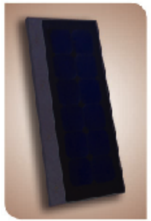
SolarSave® Roofing Tiles